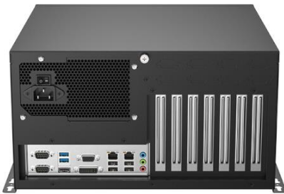
The I/O connectors are an example and depend on the Main Board installed.