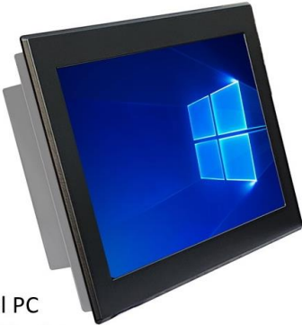
Panel PC Slim Version

Constantly evolving, our Touch Panel PC lines are designed to promptly respond to various industrial needs with expandable, versatile products with an increasingly accurate and compact design. They are designed for the classic Panel and / or Rear Panel mounting but having the VESA fixing they are often used also for Wall Mount applications (wall fixing) or Arm (fixing on arm / mechanical support). They are equipped with LCD displays from 7 inches up to 21.5 inches with Resistive or Capacitive Touch Screen, with IP65 protection on the Front.