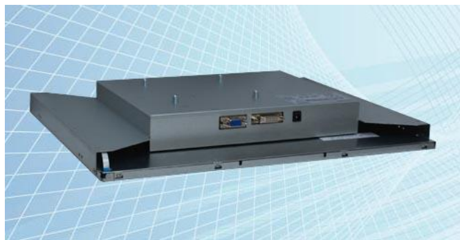
REAR VIEW ▲